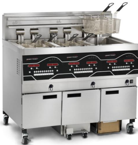
EEE 143 3-well open fryer