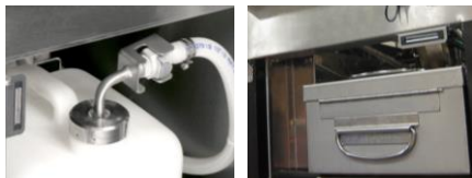
Oil replenished automatically from JIB for multi-well (left) or reservoir for 1-well (right)

Henny Penny Evolution Elite® open fryers use innovative filtering and oil level technology to extend oil life, improve product quality and reduce overall oil consumption and costs. Here's how: