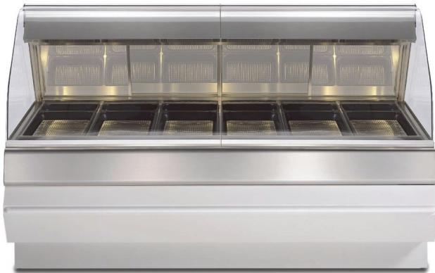
HMR 106 6-well full-serve heated merchandiser

THERMA-VEC® Even Heat Process eliminates hot/cold spots and fogging by gently circulating heat from lower elements evenly under pans, up through vents front and back, and over food. Sensors adjust temperature and air flow promptly to compensate for heat loss when serving.